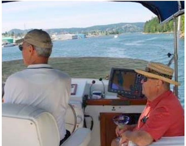
This is not the Lions bathtub.